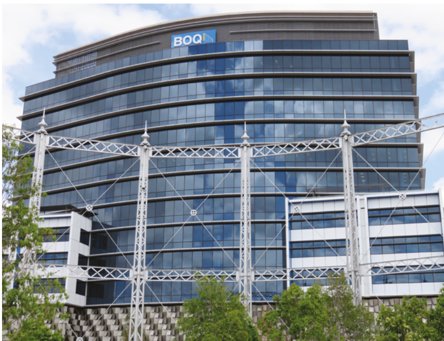
The BOQ 5 Green Star rated head office at Newstead